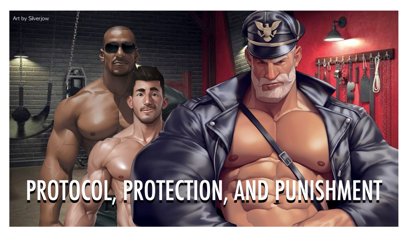
NOTE: It is not necessary to address all these topics within the allotted time for discussion; rather they have been provided merely to guide the conversation. The group may address any or all of the issues given below.