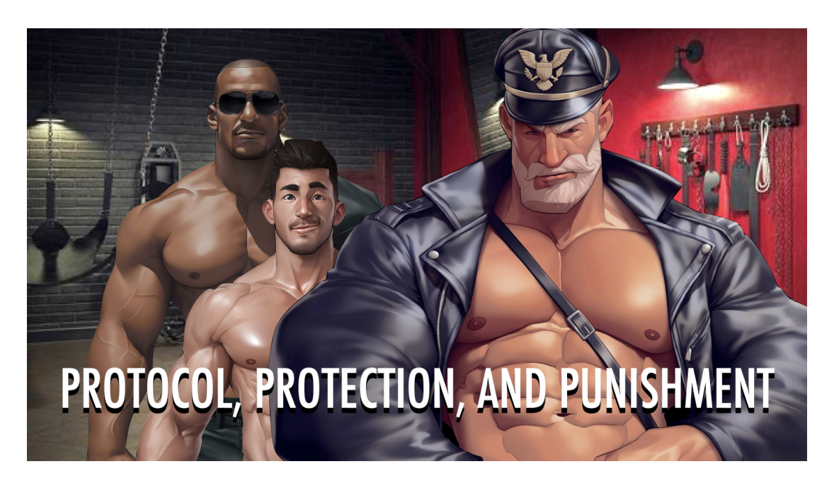
NOTE: It is not necessary to address all these topics within the allotted time for discussion; rather they have been provided merely to guide the conversation. The group may address any or all of the issues given below.