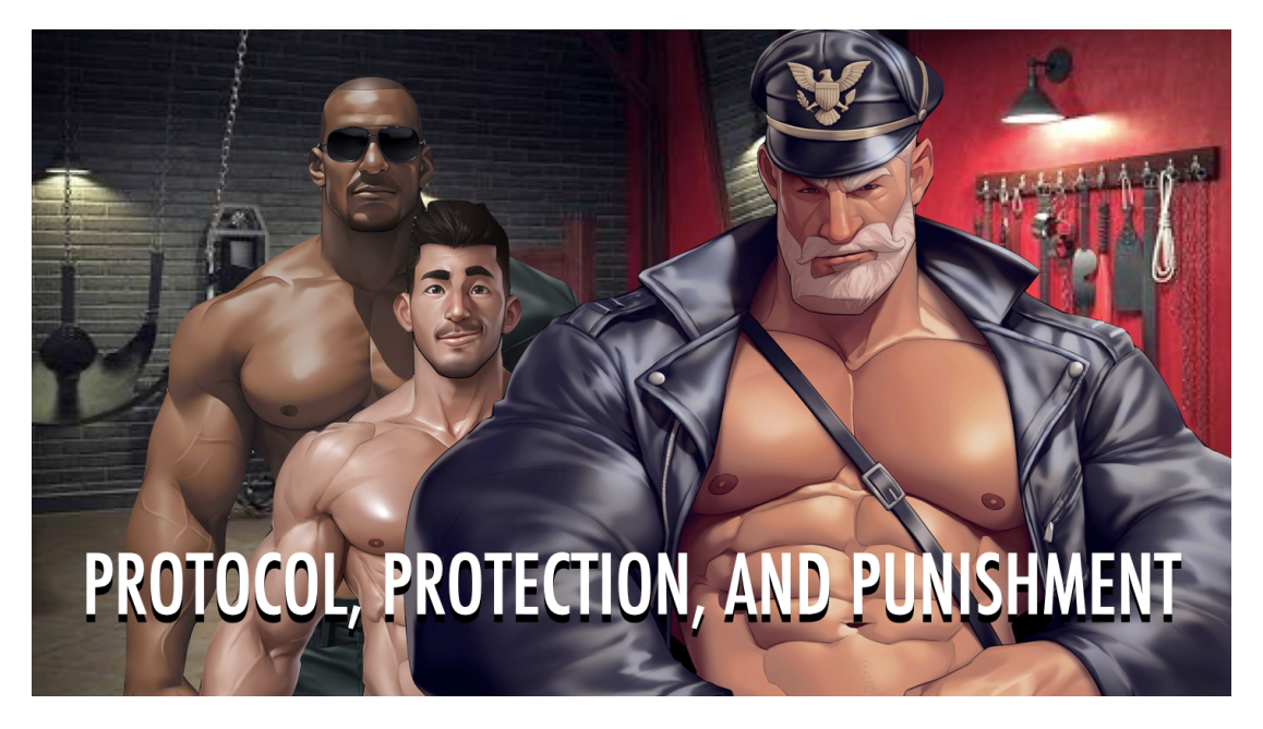
NOTE: It is not necessary to address all these topics within the allotted time for discussion; rather they have been provided merely to guide the conversation. The group may address any or all of the issues given below.